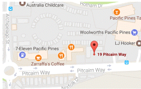
Map directions to 6/19 Pitcairn Way